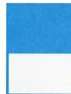
1/2 PAGE HORIZONTAL 7.875" x 4.875"