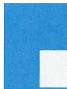
1/4 PAGE HORIZONTAL 3.875" x 4.875"