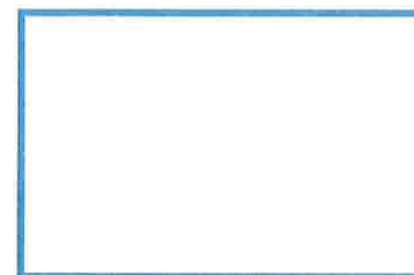
FULL PAGE SPREAD 10.5" x 8.25"