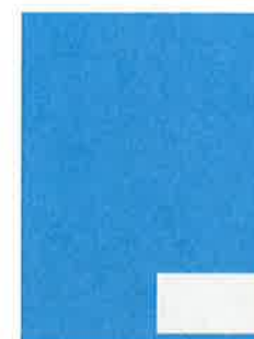
1/8 PAGE HORIZONTAL 3.825" x 2.625"