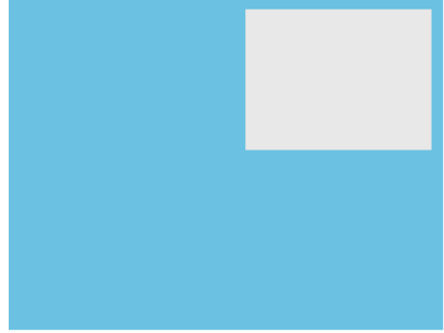
1/4 PAGE HORIZONTAL 3.875" x 4.875"